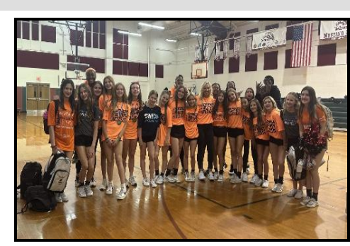
Mustangs United participants pose for a picture after a successful event!

and other Montford students helped with the event and demonstrated the importance of including everyone. Special guest appearances by F.S.U. Cheerleaders and basketball players made this event even more memorable. We appreciate all who came to participate and show support as we raise awareness about inclusion!